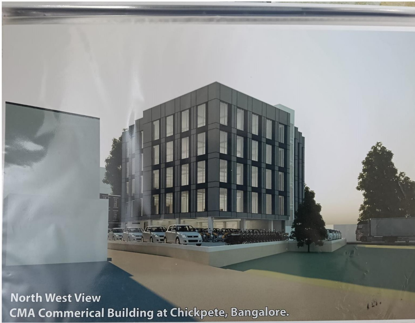
North West View CMA Commerical Building at Chickpete, Bangalore.