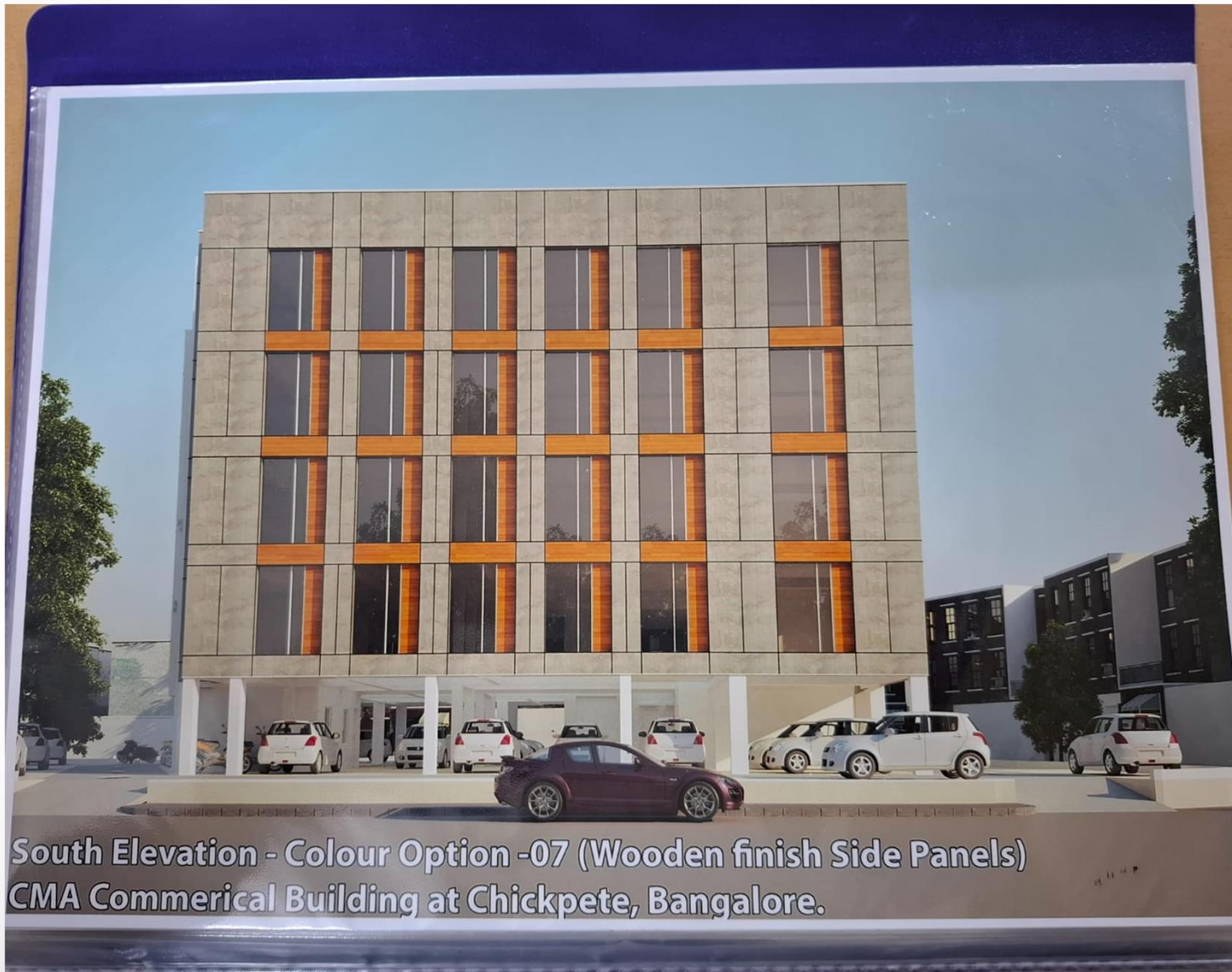
South Elevation - Colour Option -07 (Wooden finish Side Panels) CMA Commercial Building at Chickpete, Bangalore.